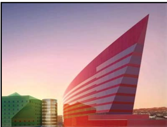
The Red Building - Pacific Design Center, Hollywood, CA, USA One Comansa 21LC550, 2009 70 m jib, 60 m height to 100 m height