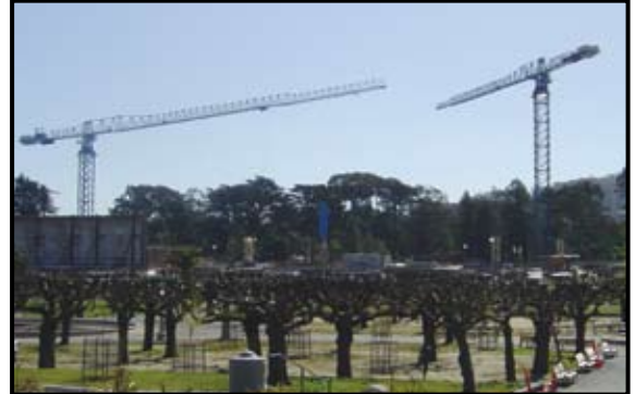
Academy of Science, San Francisco, CA, USA Webcor Builders, 2008 One Comansa 21LC550 Tower Crane, 80 m jib, 45 m height One Comansa 21LC550 Tower Crane, 75 m jib, 50 m height