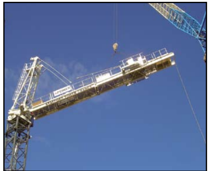
Holder Construction, Denver, CO SK415 Peiner Tower crane erection

We have factory trained and experienced field staff who respond to our customer's problems in a professional, time effective manner which exceed customer's demands and expectations, to keep their project on schedule and within budget resulting in a loyal, satisfied repeat customer base.