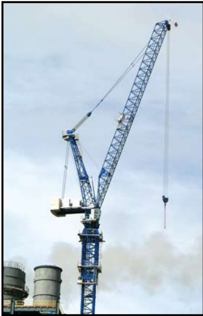
Drogheda - County Louth, Ireland Comansa LCL 500 Luffing Tower Crane, 2008 65 m jib, 120 m height