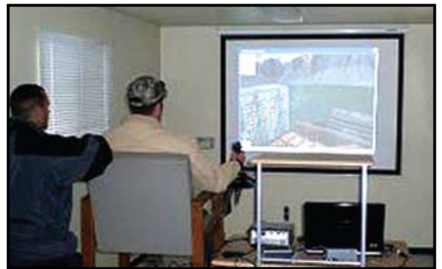
Training classroom simulator.

inspection and management. The North American training center, Tower Crane School of Phoenix, LLC, provides certified programs endorsed by the highly recognized National Commission for Certification of Crane Operators (NCCCO). We offer NCCCO operator certification in all crane categories including rigging and signaling certification.