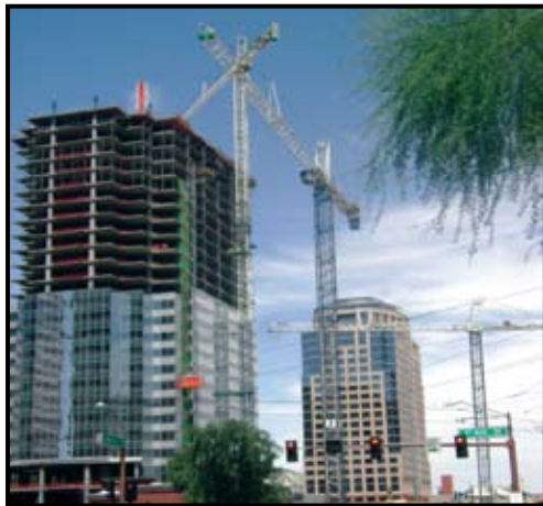
CityScape, Phoenix, AZ, - Hunt Construction, 2009 One Peiner SK575 Tower Crane, 65 m jib, 146 m height Two Peiner SK415 Tower Cranes, 75 m jib, 134 m height Two Alimak Hek Dual man/material Hoists