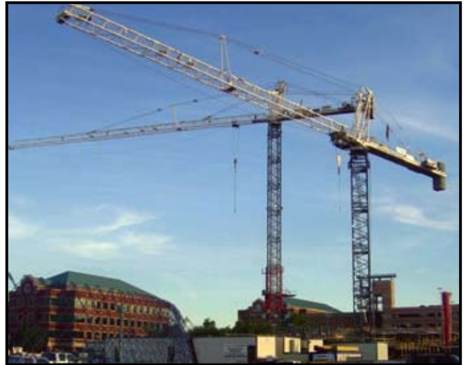
Tempe, AZ - Tempe Centerpoint

Stafford Group's fleet of tower cranes, with an average age of 5 years, are strategically placed throughout the world and provide dependable performance while keeping pace with the construction industry. Our wide range of tower cranes transport, assemble and disassemble easily, and are a cost effective part of any building construction. We offer a complete line of lifting capacities from 2 to 32 ton with radius ranging up to 85 meters (278 feet), using Terex and Comansa models with multiple options of hammerhead, flat top, luffer, static or traveling, self erecting, external or internal climbing, in response to our customer's project needs.