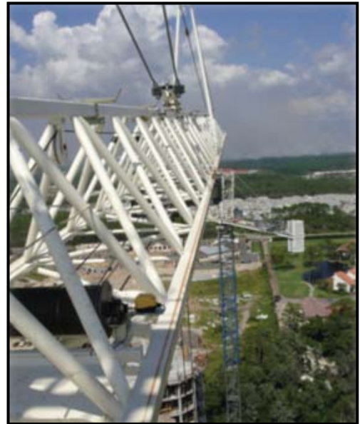
Grand Panama Condo's, Panama City, FL, USA WG Yates Construction, 2005 Two Peiner SK415 Tower Cranes, 75 m jib, 150 m height and 140 m height