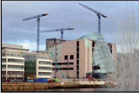
National Conference Center, Dublin, Ireland CMP Construction, 2009 Three Comansa 21LC290 Tower Cranes, 74 m jib, 65/75/85 height