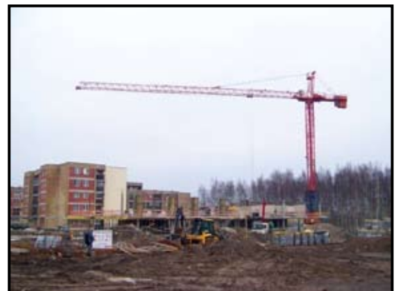
Klaipeda, Lithuania, Eastern Europe One Peiner SK70 Tower Crane, 2007 40 m jib, 35 m height