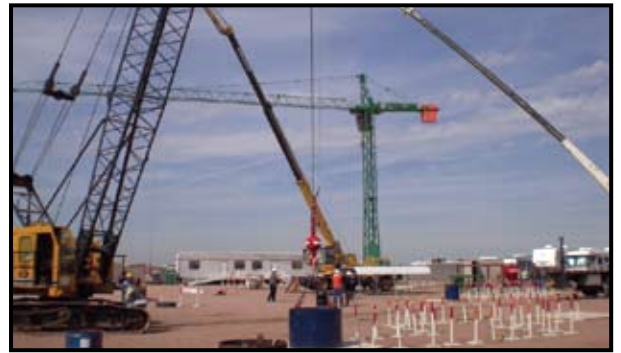
Tower Crane School of Phoenix, Apache Junction, Phoenix, AZ Potain D13 10A Tower crane Grove TMS 522 22 ton Hydraulic crane Link Belt 75 ton Lattice crane American 599 40 ton Crawler crane National 666B 17 ton Truck crane

We consult with the customers for special applications of equipment and prepare feasibility reports, provide design or technical support for foundations to support equipment including moment resisting footing, caissons, piles and steel grillages; reinforce standard towers to provide greater freestanding heights of cranes, provide inspection services for equipment, recommending solutions for repairs, design custom rigging and lifting equipment used for special applications; custom design towers for clients with special applications of crane equipment, provide calculations pertaining to the structural integrity of all construction lifting equipment, meeting international tower crane and hoist standards. From