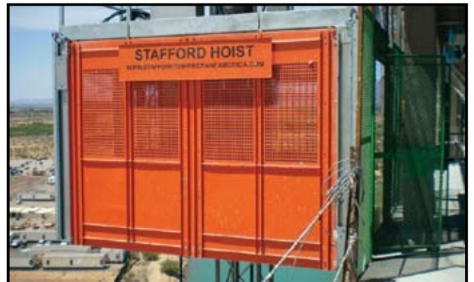
Scottsdale, AZ - Casino Arizona

Stafford Group's construction man-material hoists/elevators can transport up to 30 workers and materials weighing up to 3200 kg (7,100 lbs) quickly and safely on your project. Available in single or dual car configurations with an inside dimension of 3.9 meters (12.9 feet). Alimak Hek construction hoists are durable and economical additions to any job site. With variable frequency control and travel speeds of 100 meters per minute (330fpm) can be achieved.