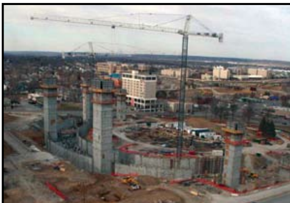
Midtown Crossing, Omaha, NE, USA Weitz Construction Company, 2009 One SK315 Peiner Tower Crane, 70 m jib, 55 m height