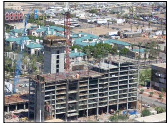
Arizona State University - Taylor Place Student Housing Austin Commercial / Suntec Concrete, 2007 One Peiner SK415 Tower Crane, 75 m jib, 61 m height