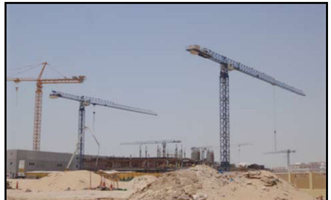
Dubai Investment Park Labor Accommodation, Dubai, UAE Two Comansa 21LC290, 74 m jib, 35 m height One Comansa 10LC140, 55 m jib, 35 m height One Comansa 11LC160, 60 m jib, 35 m height