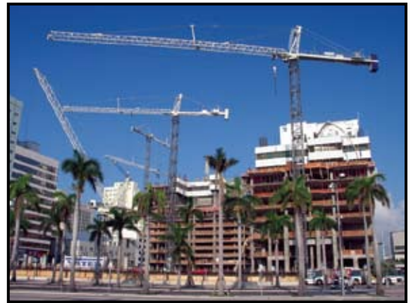
Everglades on the Bay, Miami, FL, USA WG Wates Construction, 2007 Two Peiner SK415 Tower Cranes, 75 m jib, 198 m height One Peiner SN406 Luffer, 50 m jib, 106 m height