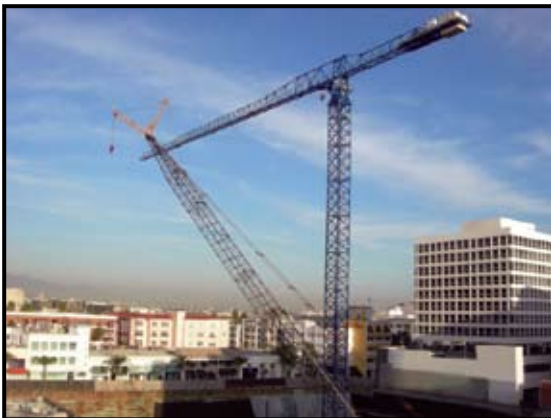
Montage Hotel, Beverly Hills, CA, USA Charles Pankow Builders, 2008 One Comansa 21LC550, 80 m jib, 71 m height