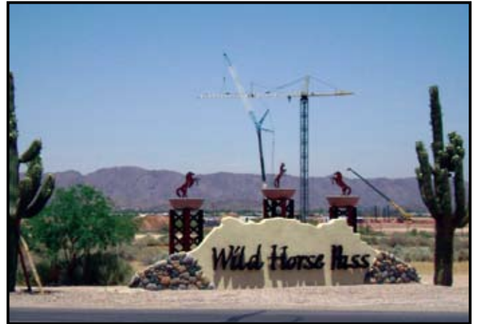
Peiner SK 400 Wild Horse Pass Casino, Chandler, AZ

Don't cost your company and project money by missing the hidden costs that are, unfortunately, so rampant within the industry.